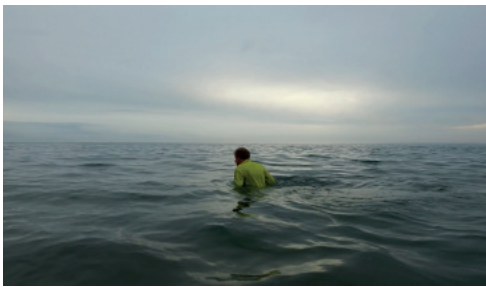
Going Nowhere 1.5 (Production Still) , 2016 Digital photograph

For further details and images please contact: